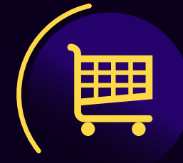
Bit Hub Shopping