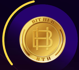
Bit Hub Coin