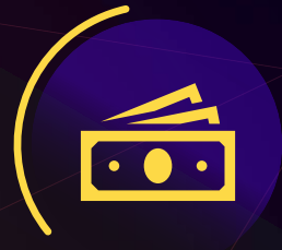
Bit Hub Pay