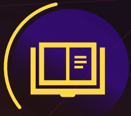
Bit Hub Book