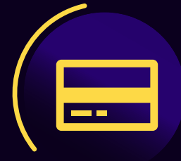
Bit Hub Card