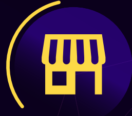
Bit Hub Store