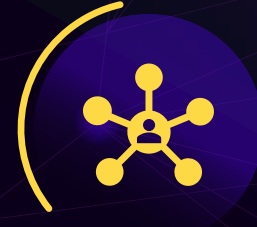
Bit Hub Blockchain