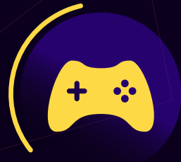
Bit Hub Games