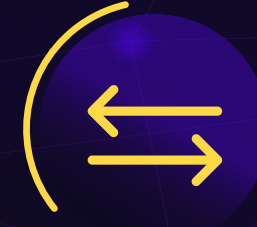
Bit Hub Self Exchange