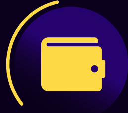
Bit Hub Wallet